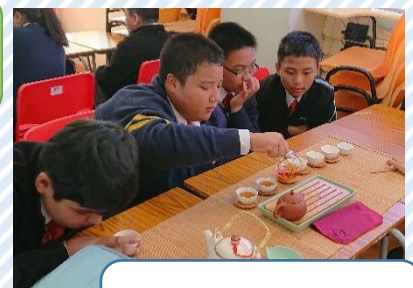
Chinese Tea Brewing Workshop

In order to expose our NCS students to Chinese culture, we have invited a tea-making expert to share her expertise and teach us the history of tea. Besides, the school also held a lantern riddle quiz and moon cake tasting during Mid-Autumn Festival to enrich the festive atmosphere!