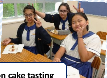
Moon cake tasting